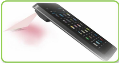
1.Expansion Kit - BCR (Barcode Reader)