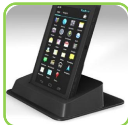
9.Accessory Charging Cradle