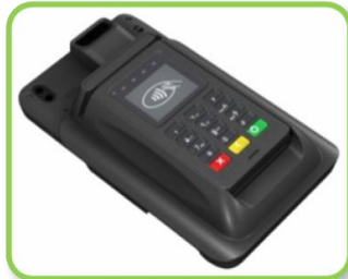
4.Payment Enabled Function