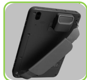
8.Accessory Handbelt Design