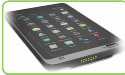
2.I/O Functions - Pogo PIN Link With Cradle + Mini USB + Fingerprint