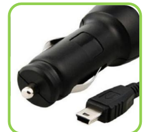
11.Accessory Car Charger