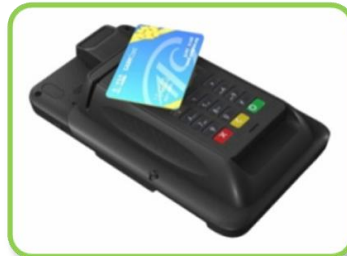
5.Payment Enabled Functions NFC Usage