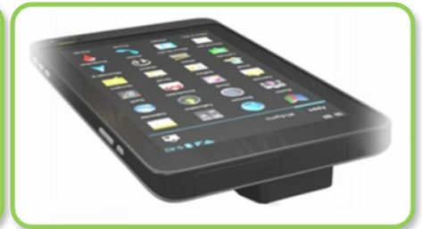
3.I/O Functions - Type A USB + HDMI + BCR + Audio Jack