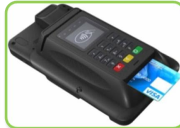
6.Payment Enabled Function Smart Card Reader Usage