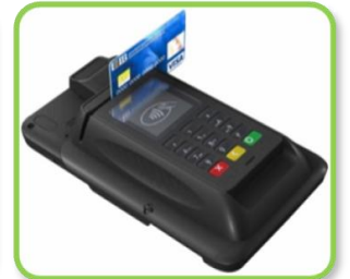
7.Payment Enabled Function MSR Usage